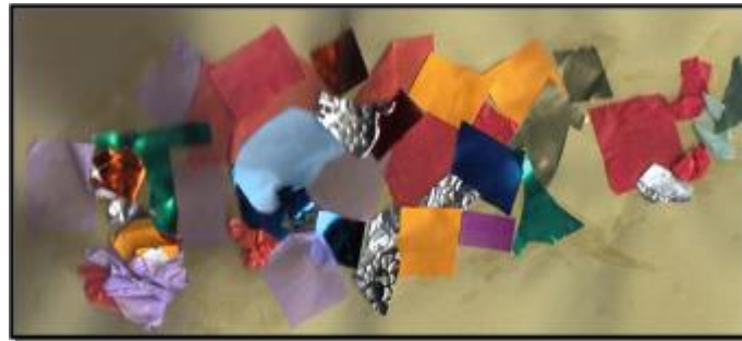
'Having Fun Sticking'

Protecting the environment is important to us and we have taken a number of steps to help reduce our carbon footprint. We recycle as much as possible and, rather than becoming part of landfill, our nappy waste is used in an innovative scheme run by Calabash Ltd to heat Hillingdon Hospital.