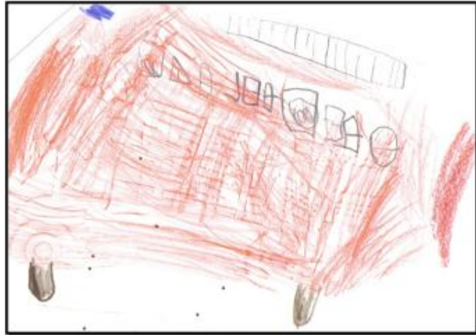
'Big Red Bus'