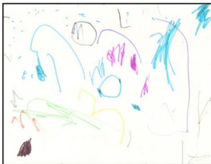
'Shapes, Swirls and Colours'

Monthly observation sheets are completed by your child's key worker, outlining their progress in each area of the curriculum. These sheets also contain a section allowing you, the parent, to inform the nursery of any observations you may have made at home or any comments you wish to make on the observations made by staff. We welcome and encourage such feedback.