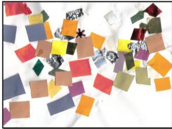
'Hundreds and Thousands'

Birthdays are special times for all, especially children, and we do like to celebrate them within the nursery with a special tea. Parents are welcome to provide a birthday cake and come along, as are brothers and sisters.